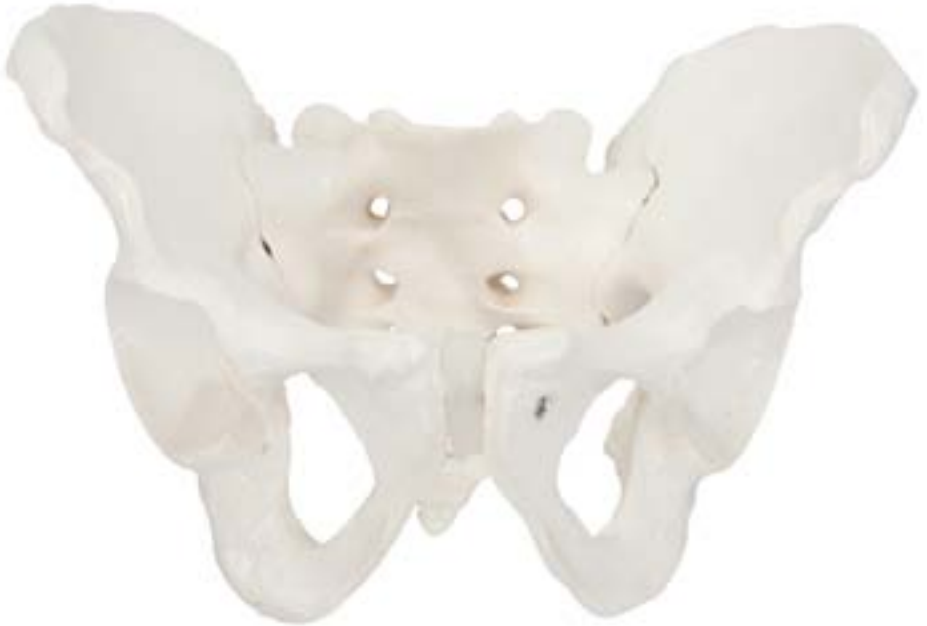
Axis Scientific Male Skeletal Pelvis