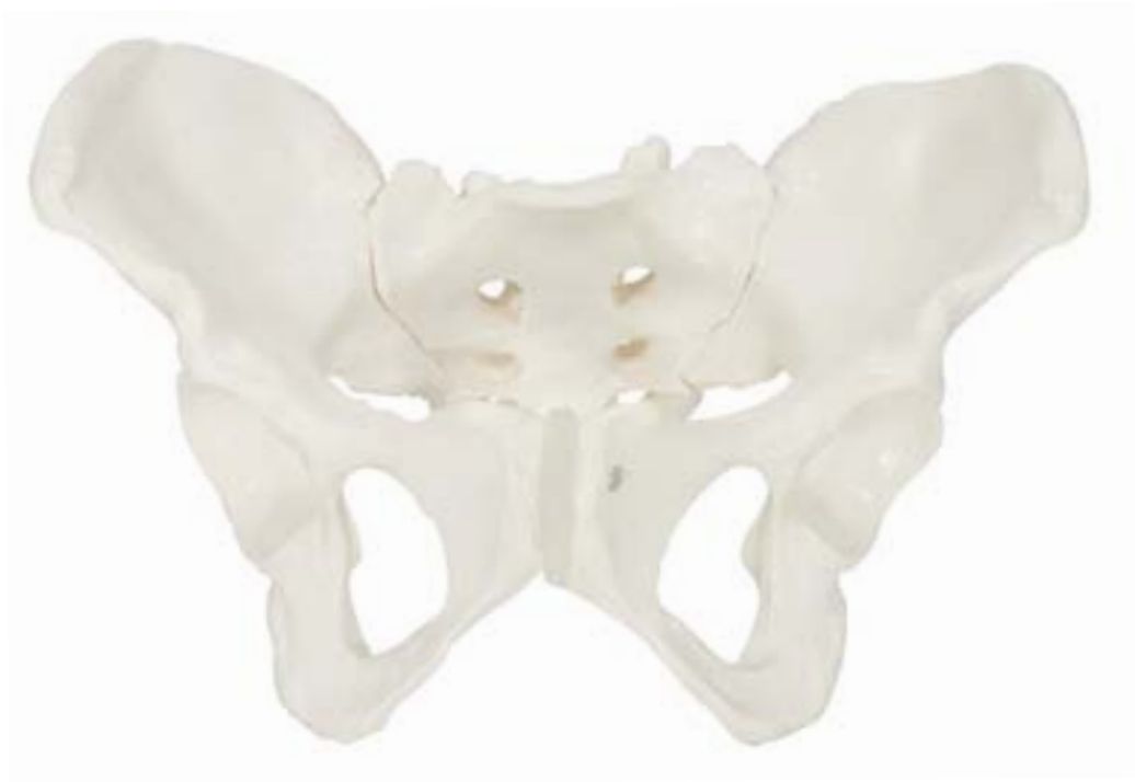
Axis Scientific Female Skeletal Pelvis