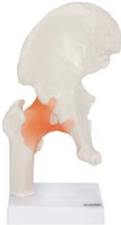
Axis Scientific Flexible Hip Joint