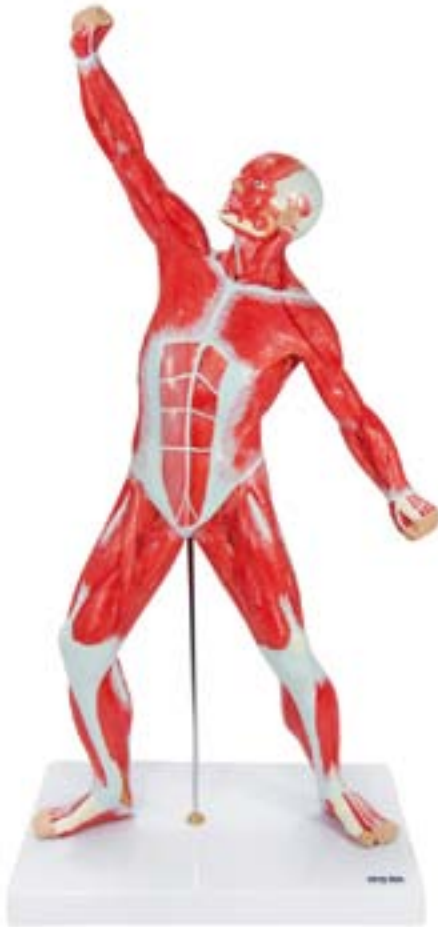
Axis Scientific Miniature Human Muscular Figure