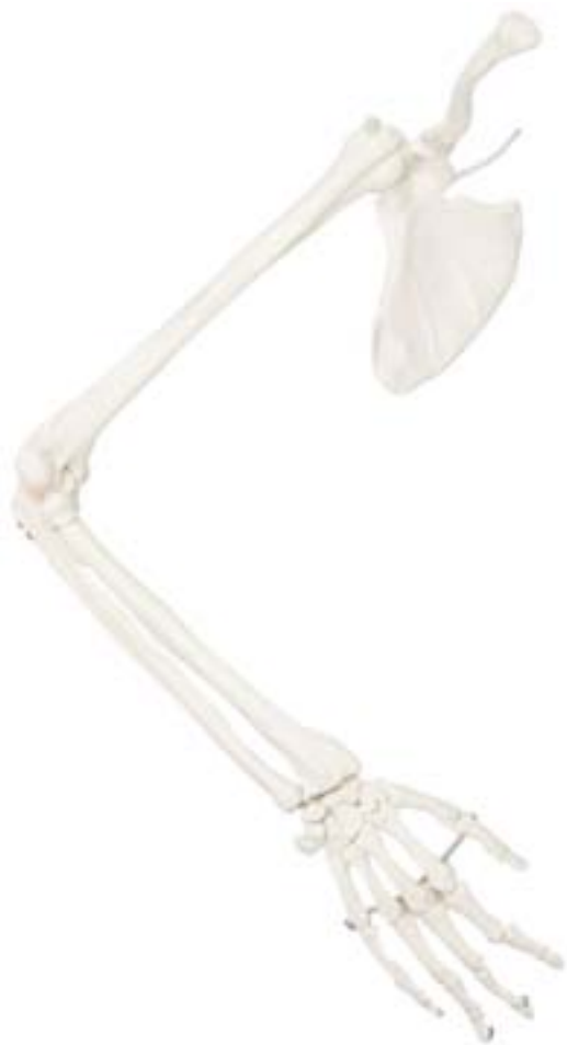
Axis Scientific Arm Skeleton