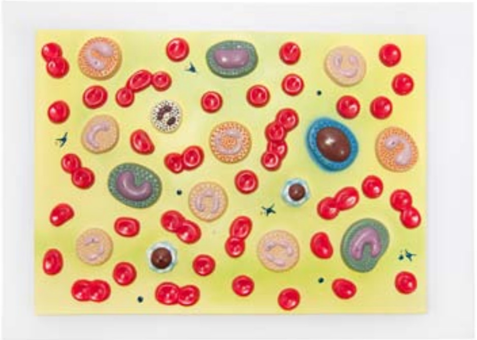
Axis Scientific Human Blood Cells