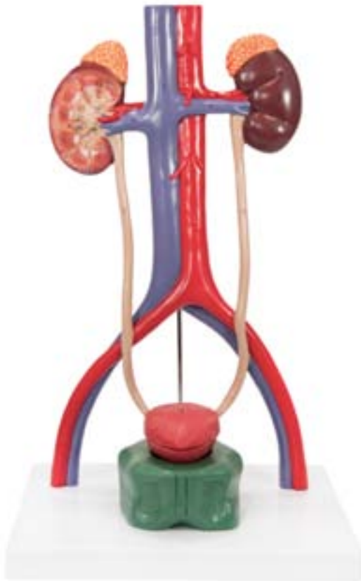
Axis Scientific Urinary System