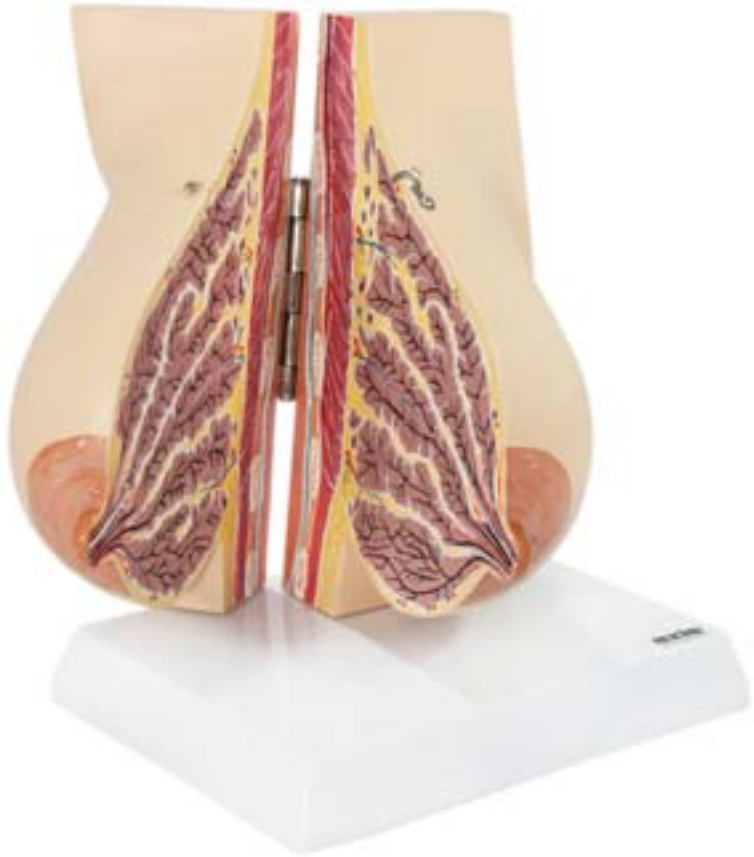
Axis Scientific Breast in Lactation Period