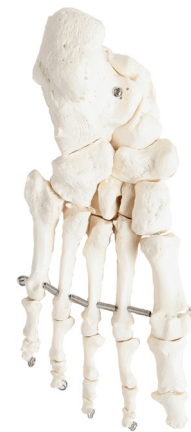
Left Foot (Inferior View)