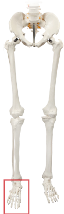
Right Foot (Inferior View)