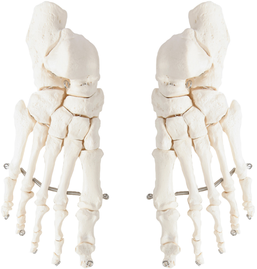
Axis Scientific Wire Mounted Feet