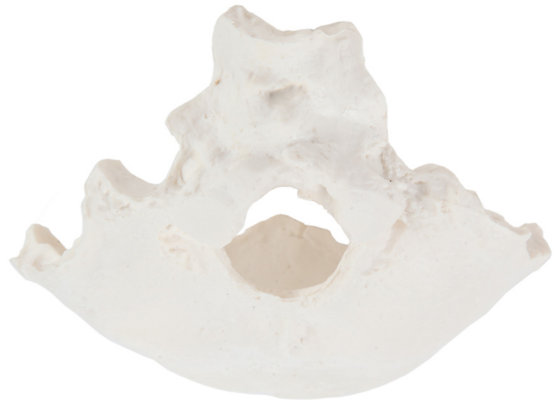
Axis Scientific Occipital Bone