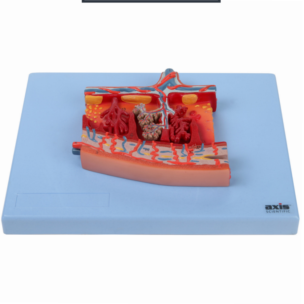
Axis Scientific Cross-Section of Placenta