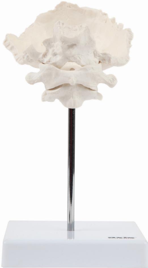
Axis Scientific Occipital Bone & Cervical Spine (C1 & C2)