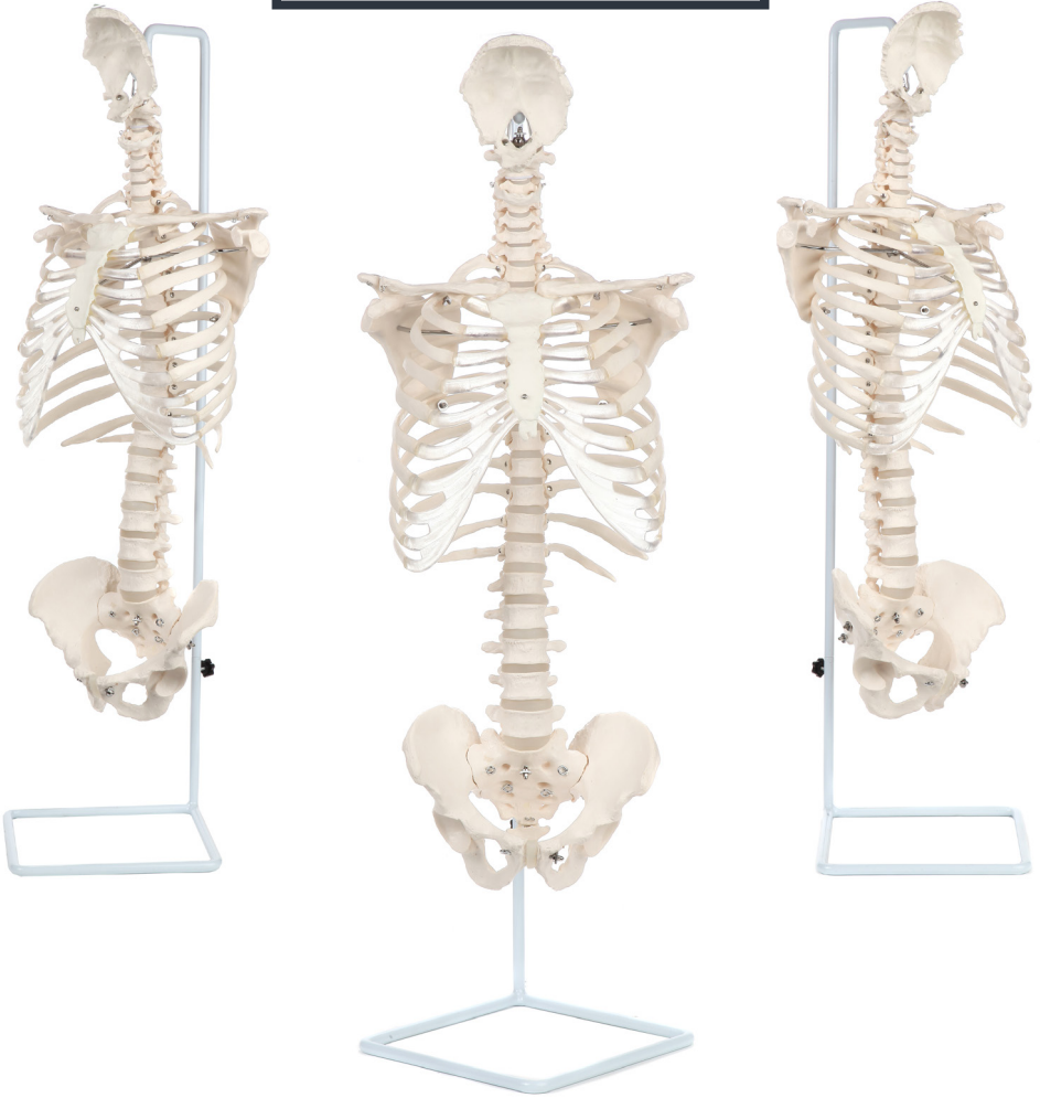
Axis Scientific Vertebral Column with Rib Cage