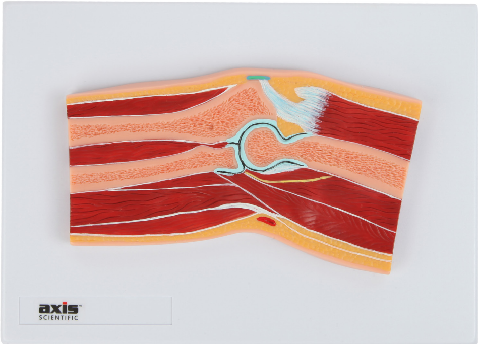
Axis Scientific Elbow Joint Section Model